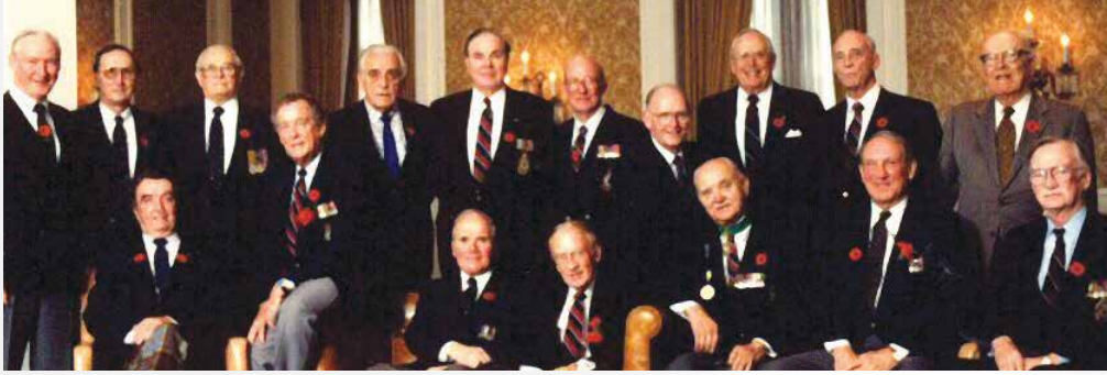
Club members who had served, circa 1990

Over 100 years since Armistice Day. Over 75 years since the D-Day landing. We must never forget. Those still with us who have served in the military are: